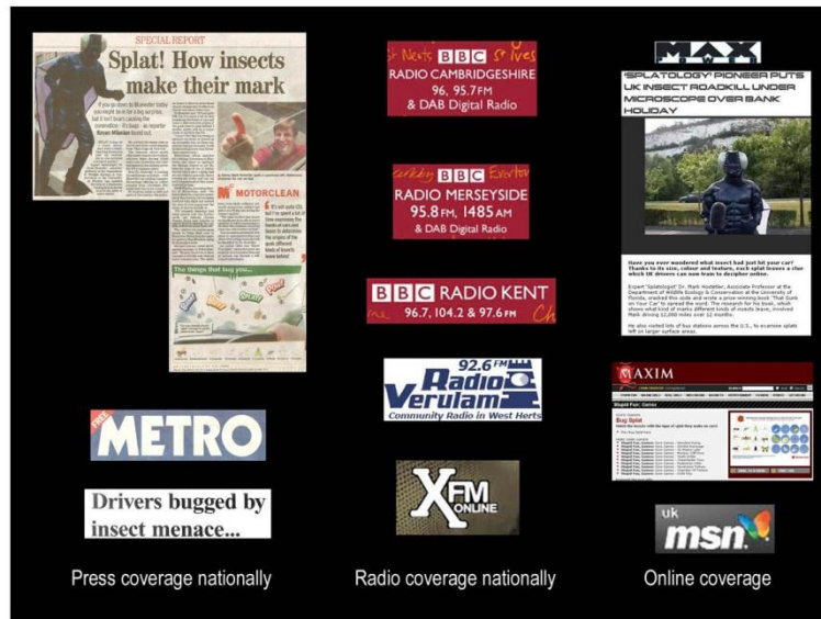
Press coverage nationally